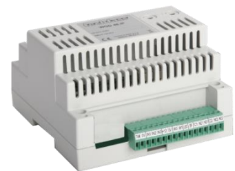
Pic. 1: NWGD 46

The PIN code has 4 digit fixed length in APS 400 systems.