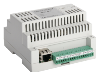
Pic. 2: MWGD 46XT.IP

This module is functionally compatible with the previous one but in addition it is set by Ethernet interface for a direct connection to LAN using TCP/IP protocol ( Pic.2 ). This door module can substitute the combination of MWGD 46XT and RS 485 / TCP/IP converter with price and installation benefit.