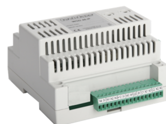
Pic. 1: MWGD 46XT

A module for general use ( Pic.1 ). It is designed for control of up to 4 APERIO wireless locks and/or for connection of one or two standard readers with Wiegand interface independent of the identification technology. So, various reader technologies (HID Proximity, iCLASS, Mifare, Mifare DesFire, Indala etc.) according to the needs of customers can be used in APS mini Plus access control system.