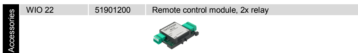
Table 4: Special accessories