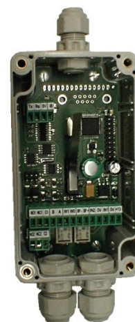
Pic. 1: NRIF 232-GP

A module is designed for connection to the APS BUS of the APS 400 identification system, where it occupies a single address. Up to 64 NRIF 232-GP modules can be connected to a single MCA 168 controller. The modules can be combined with other modules at a single communication line.